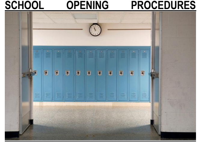
Tuesday, September 3, 2013

Prior to school opening, students should note the name of their homeroom teacher, homeroom number and room location. These will be posted on the front entrance doors as of noon on Friday, August 30th. Homeroom and class rotation will take 90 minutes. Regular full classes will begin on Wednesday, September 4th at 8:30 am. During Homeroom period, teachers will collect supplementary fees & forms, hand out timetables & agenda books, and assign lockers.